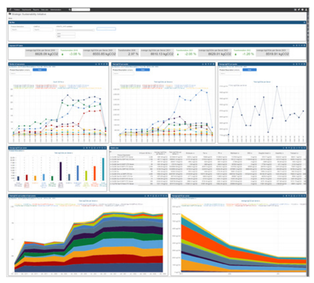
Full analytics dashboard shows high level success in CO2 footprint reduction and allows for drilling down into any dimension for details.

Compare and use business intelligence (BI) to analyze the infrastructure setup in regard to CO2 and other emission values in every dimension: zonal location (building, floor, room, cage, rack), manufacturer (with product lines/families, models), organizational unit responsible, and device type. Data can further be sliced and diced by virtually any dimension available in FNT Command, out-of-the-box.